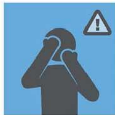
AVOID TOUCHING YOUR EYES, NOSE, OR MOUTH WITH UNWASHED HANDS OR AFTER TOUCHING SURFACES