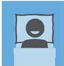
GET ADEQUATE SLEEP AND EAT WELL-BALANCED MEALS