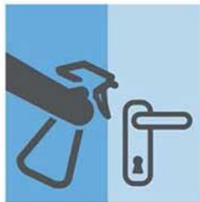
CLEAN AND DISINFECT "HIGH-TOUCH" SURFACES OFTEN