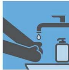
WASH HANDS OFTEN WITH WATER AND SOAP (20 SECONDS OR LONGER)