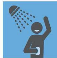
PRACTICE GOOD HYGIENE HABITS

For more information, visit: coronavirus.ohio.gov