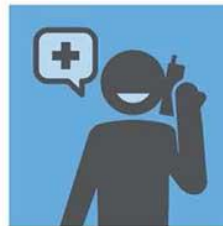
CALL BEFORE VISITING YOUR DOCTOR