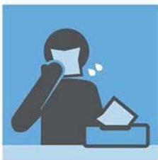
COVER YOUR MOUTH WITH A TISSUE OR SLEEVE WHEN COUGHING OR SNEEZING